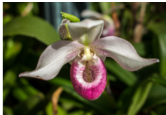
MN state flower...the Lady Slipper

Sunday- Wake up, reminisce, hugs, and hit the road for a safe ride home.