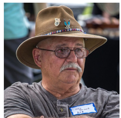
February 24, 1941 - October 8, 2023

clerk@legrand-ia.gov | www.legrandiowa.com